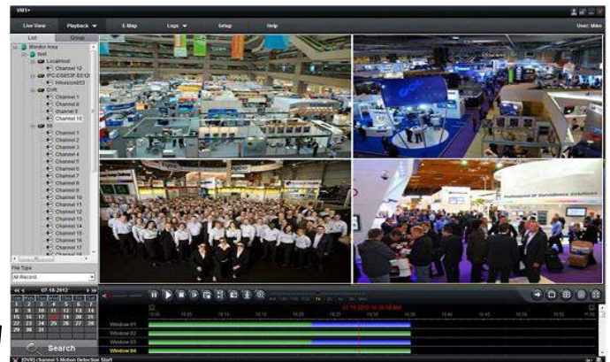
Time Line Playback(Local & Remote)