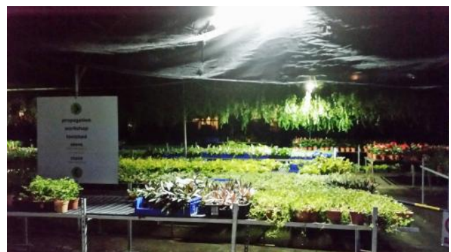
Propagation process of plant and vegetable by 6630H white color grow light 2

Picture on left exhibits the indoor hydroponic vegetable plant using 6630H compact batten. Light source of the luminaire is deep blue mixed with deep red SMD module complete with built-in driver. It was customized in accordance with the horticulturist's designated spectrum promoting the photosynthesis for plants throughout the vegetative and reproductive growth stages.