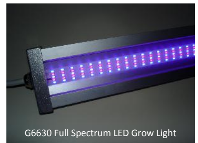
G6630 Full Spectrum LED Grow Light

NOVETE® 6630-H series is high intensity LED grow light designed in elongated shape with standard length of 0.6 and 1.0 meter. The sturdy body structure is made of high grade aluminum material anodized in silver color. The luminaire is IP65 compliant which is also resistance to dust and corrosion.