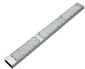
G8055 Modular High Intensity LED Grow Light