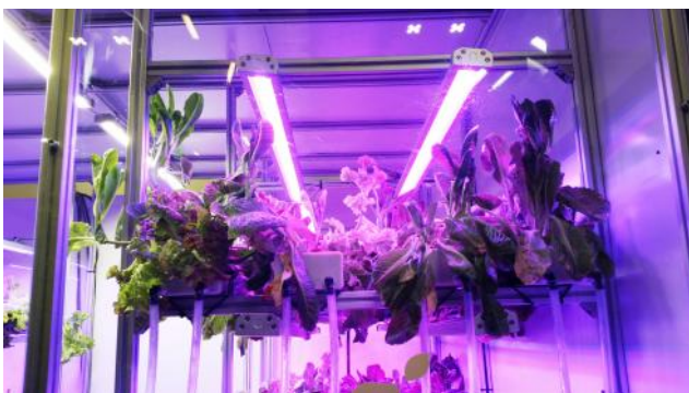
Deep blue and deep red 6630H compact LED batten for indoor hydroponic vegetable plant with good harvesting

Picture on left exhibits the indoor hydroponic vegetable plant using 6630H compact batten. Light source of the luminaire is deep blue mixed with deep red SMD module complete with built-in driver. It was customized in accordance with the horticulturist's designated spectrum promoting the photosynthesis for plants throughout the vegetative and reproductive growth stages.