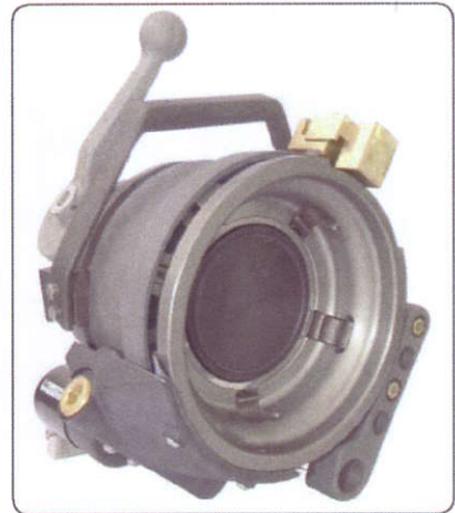
| API coupler e.g. K2P