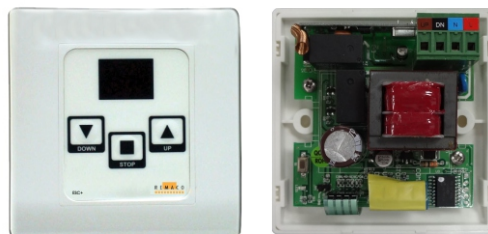
AVA-ESC+ Electronic Screen Control