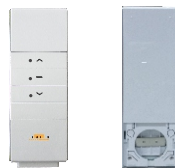
AVA-315 Radio Frequency Remote