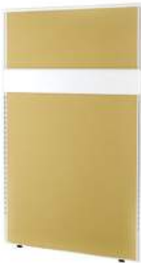
Flo-Fabric Panel-Mid Raceway