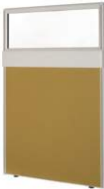
Flo-Half Glass Fabric Panel-Mid Raceway