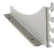
Desking Panel Bracket