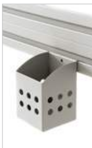
Pencil Box On Accessories Organizer