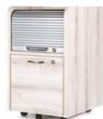
Tambour Door With 1 Filing Mobile Pedestal