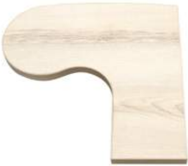
L-Shape Top With Curve & Round Return