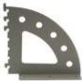
Open Shelf Bracket