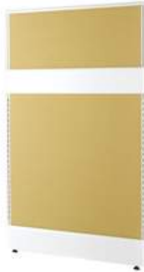
Flo-Fabric Panel-Mid & Base Raceway