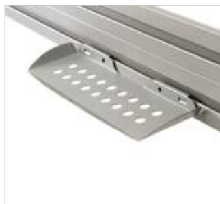
Pencil Tray On Accessories Organizer