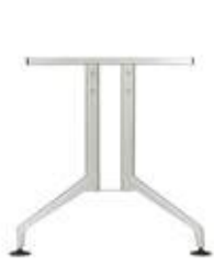
Flat Twin Spider Leg