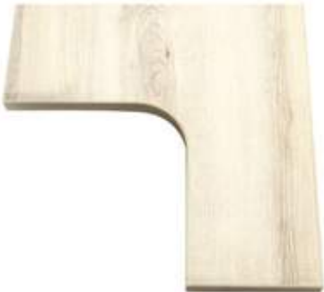
L-Shape Top With Straight Return