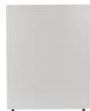
Side Panel Leg For Side Return