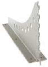
Cantilever Bracket Middle