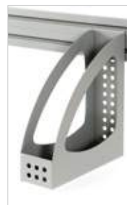
Box File Holder On Accessories Organizer