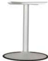
Trumpet Table Leg Base