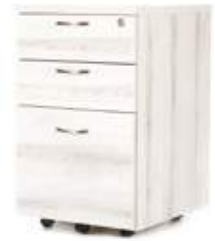
Mobile Pedestal-2 Drawer 1 Filing