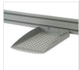
Paper Tray On Accessories Organizer