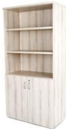
Open Shelf + Swing Door High Cabinet