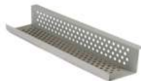
Wire Holder Perforated Trunking