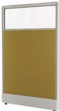
Flo-Half Polycarbonate Fabric Panel-Base Raceway