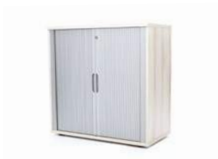
Tambour Door Low Cabinet