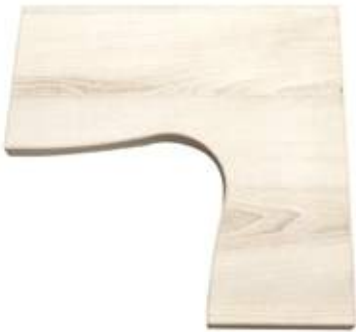
L-Shape Top With Curve & Curve Return