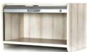
Tambour Door Hanging Cabinet