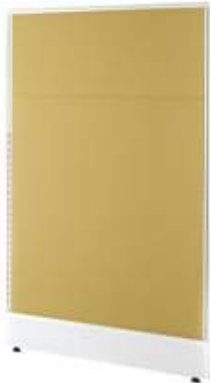
Flo-Fabric Panel-Base Raceway