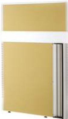
Flo-Fabric Panel-Mid Raceway With Wire Access Management