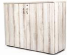
Swing Door Low Cabinet