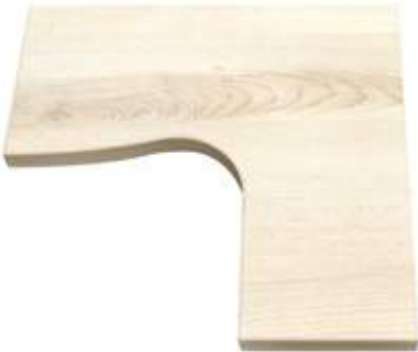
L-Shape Top With Curve & Transition Return