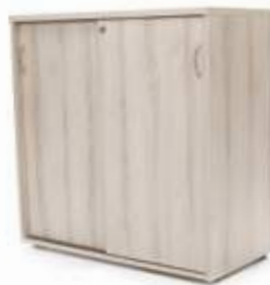
Sliding Door Low Cabinet