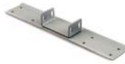
Counter Top Bracket -58