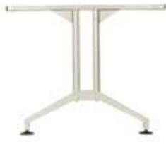
Round Twin Spider Leg