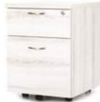
Mobile Pedestal-1 Drawer 1 Filing