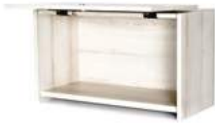
Flipper Door Cabinet (Hydraulic Mechanism)