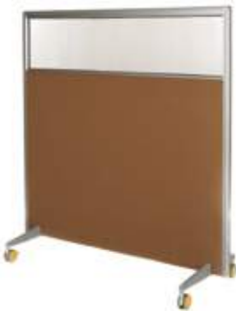
Flo-Panel With Castor