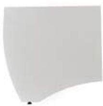
Side Panel Leg (Curve & Curve) For Main Table