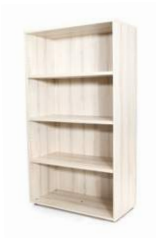
Open Shelf High Cabinet