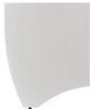
Side Panel Leg (Curve & Curve) For Side Return